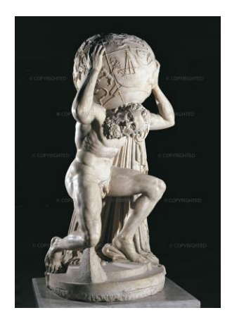
Fig.2 : Pirro Ligorio (British Museum) and Atlante Farnèse (Museo archeologico di Napoli).